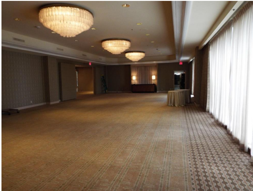
This photo shows Four Seasons Ballroom Foyer (looking back towards Austin & Austin Foyer entrances)